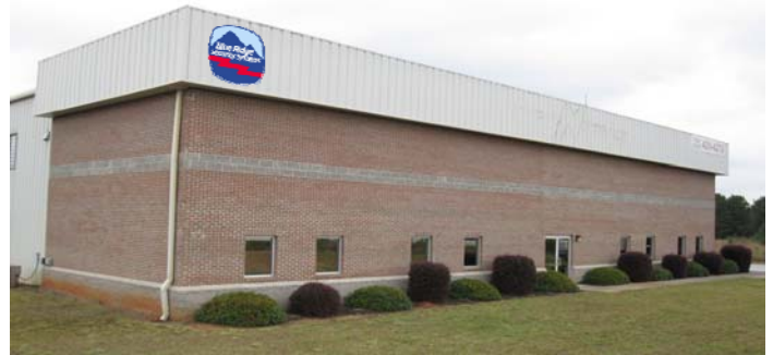
New facility fronts I-85 in Anderson County.

Blue Ridge Security Systems recently announced plans to move from its current location on 1212 N. Fant Street in Anderson to a larger facility near the Intersection of I-85 and Hwy 81. All operations, warehouse and administration personnel will occupy the building now located at 16 Red Fox Road in Williamston. The 10,000 sq. ft. facility located at that site will be renovated and an additional 10,000 square foot structure will be built immediately behind the existing building.